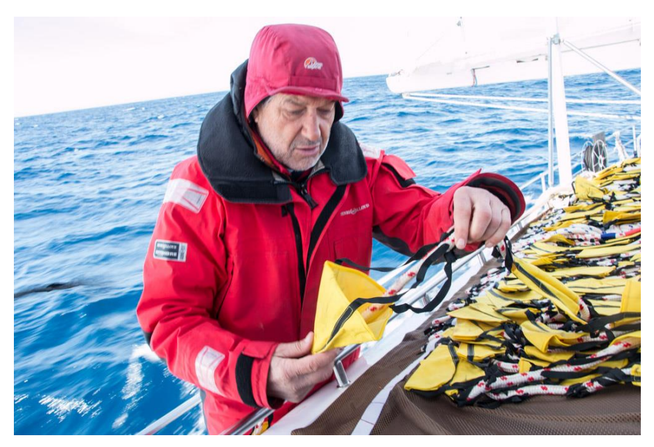
It is essential that the materials used on the cones can withstand the forces exerted

The JSD is a "one size fits all" solution for various wind strengths and wave heights and therefore the drogue should be over engineered to suit hurricane force winds with reinforced anchor points, sufficient length between the bridle and the first cones and strong fabric used for the cones themselves. There is also some debate about how much weight is required to keep the JSD below the surface in all conditions. From the feedback from others and my own experience the weights suggested on the websites are on the light side and I and others have added extra weight to keep the drogue trailing below the surface. Also, each vessel is different in handling characteristics, layout, etc so a suitable method for storage, launch and retrieval for one boat may not suit another.