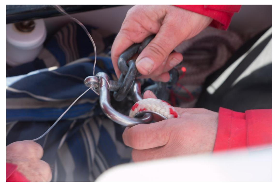
All shackles should be moused